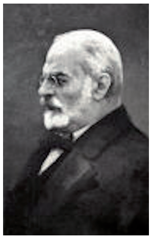
Fig. 2. Petros Protopapadakis.